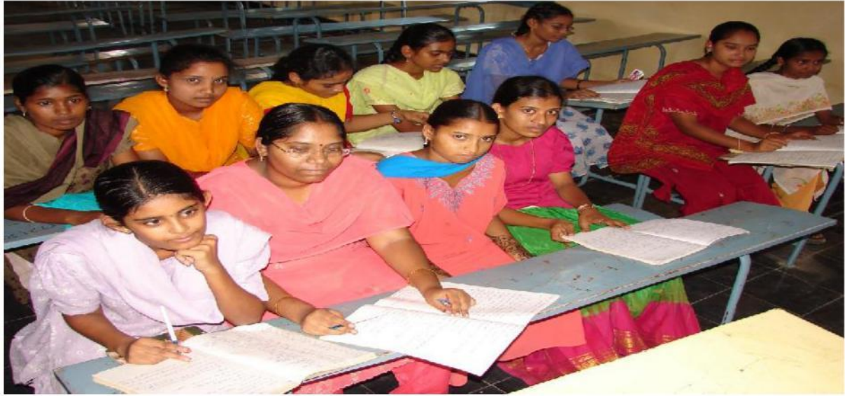
All Girls participating Computer literacy Classes