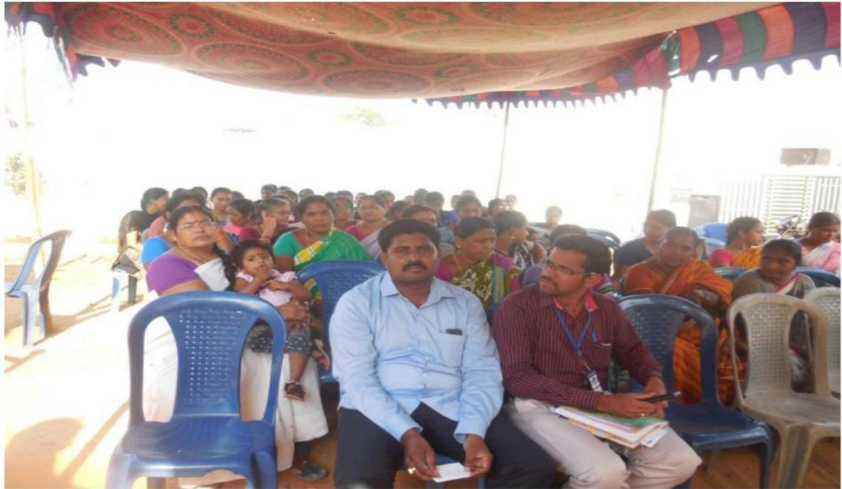
Gathering seen at Ambhapuram on computer literacy day