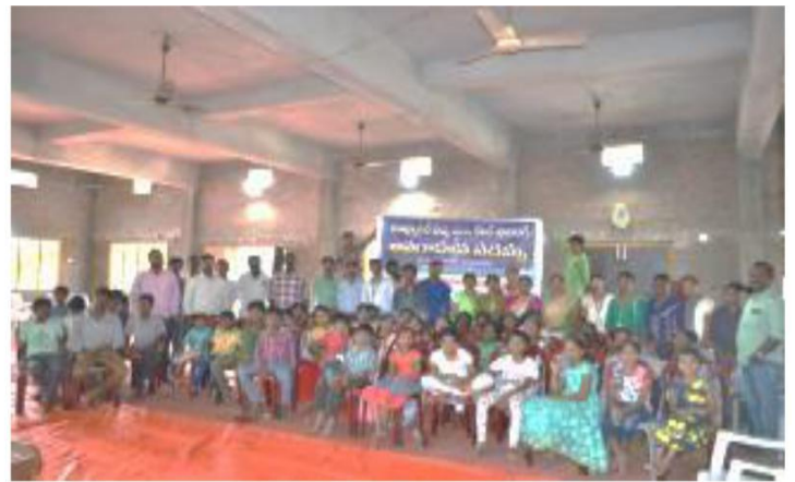
Interaction by Faculty members of computer science department with participants of camp.