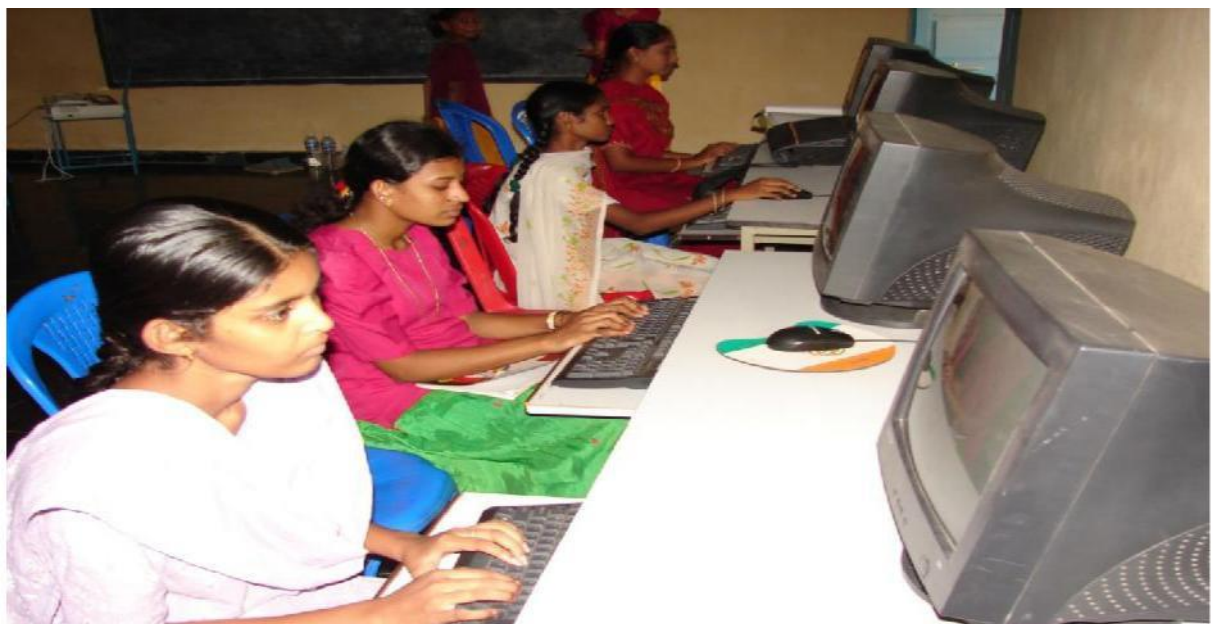
Girls practising on computers after Conducting of Computer literacy programme