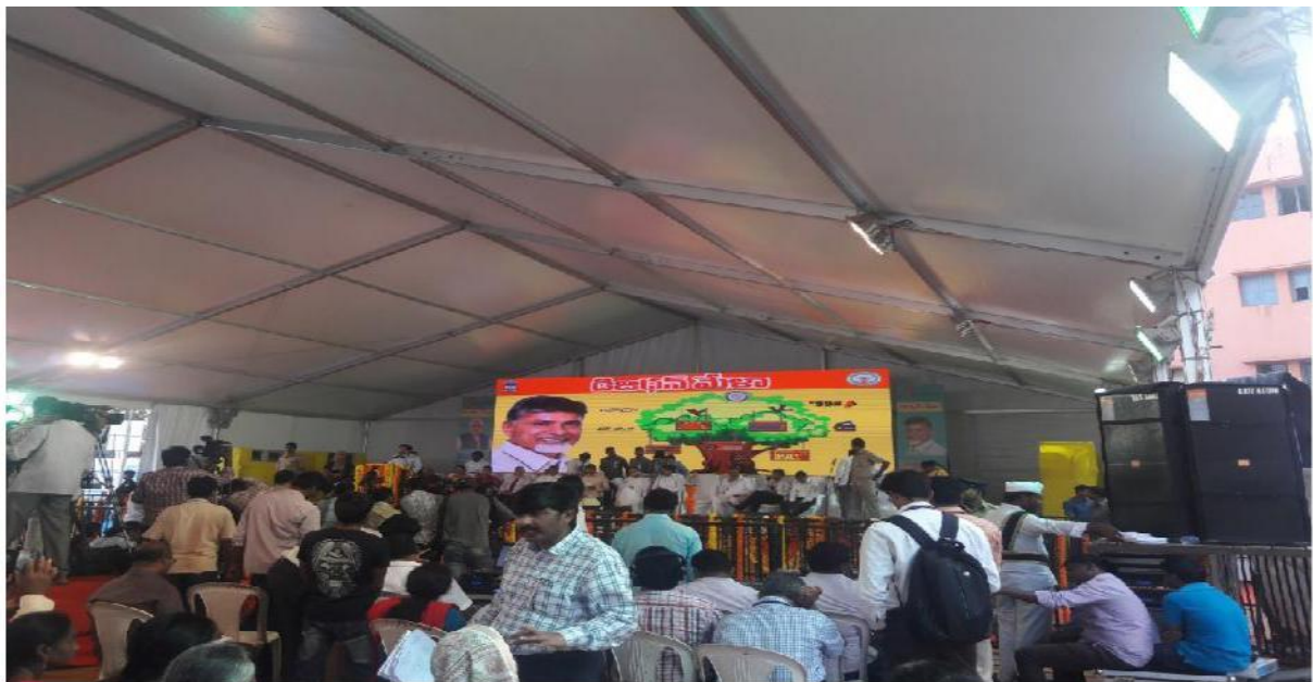
DIGI DAN MELA at PWD GROUNDS,VIJAYAWADA