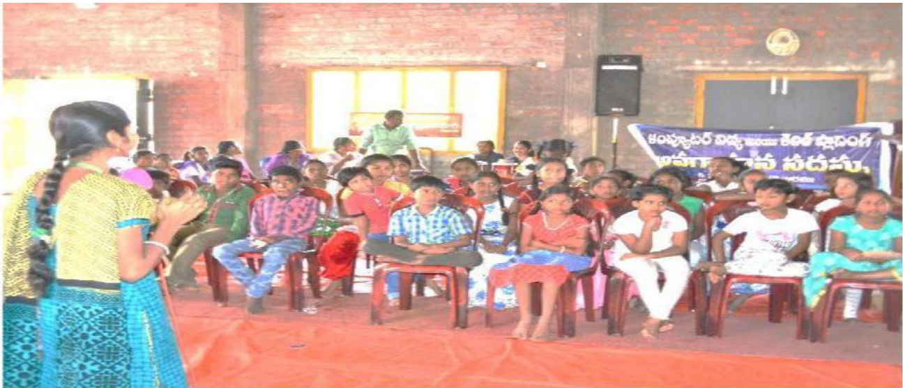
Our college III BCA student creating awarenss on computer literacy