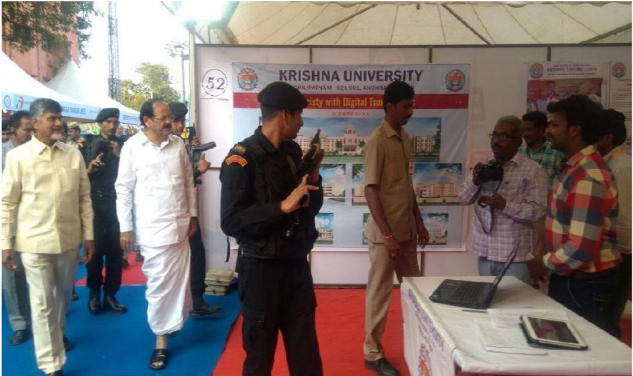
Chief minister of AP Sri N.CHANDRA BABU NAIDU & UNION MINISTER Sri M.VENKAI AH NAIDU visiting the Stall of DIGIDAN MELA at PWD grounds