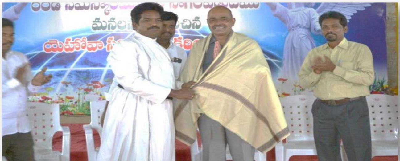
Church Father of Ambapuram felicitating Principal of KBN College.