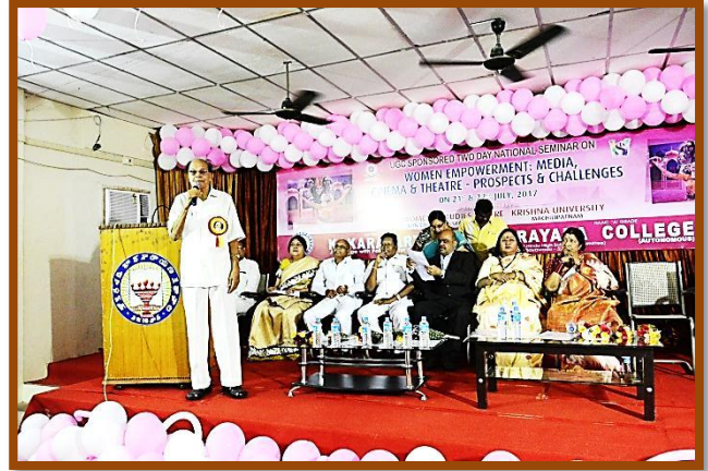
Padmasri Turlapati Kutumbarao addressing the gathering