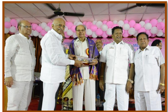
Felicitation to Padmasri Turlapati Kutumbarao