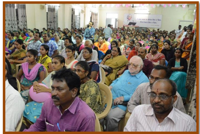
Staff & Participants