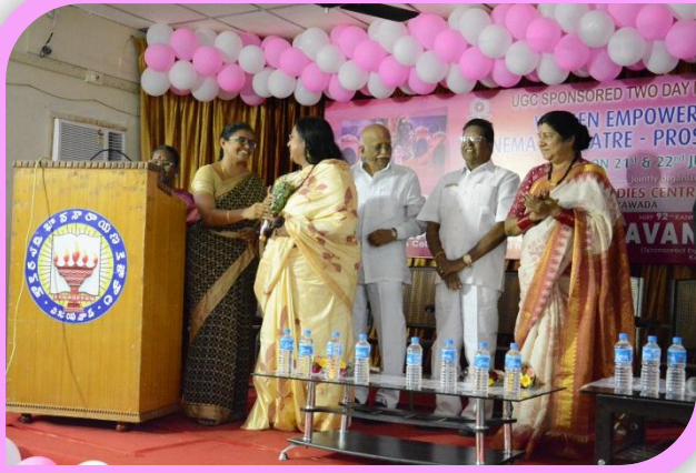
Kalabinetri Smt. Vani Sree, Legendry Actress honoured with a bouquet