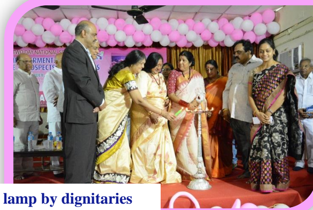
Lightening of the lamp by dignitaries