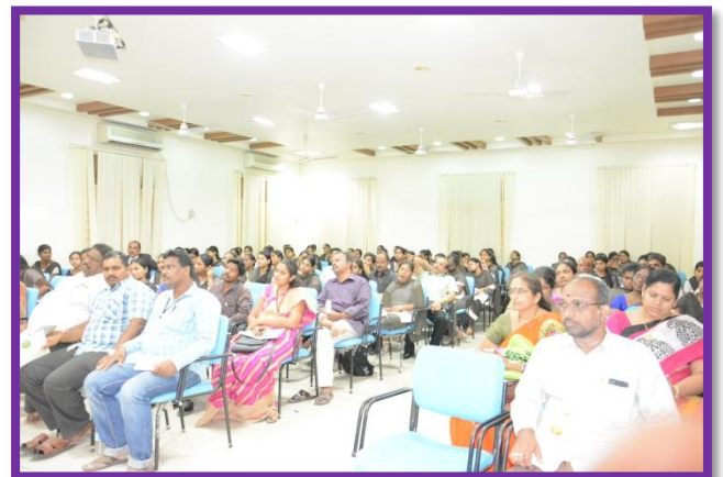
Staff & Participants at the Valedictory Session