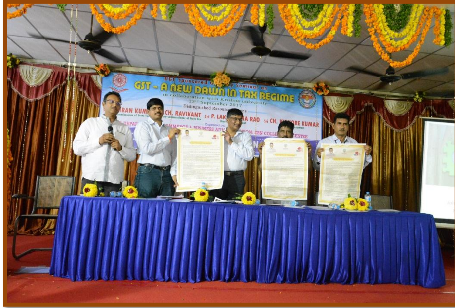
Poster release by delegates