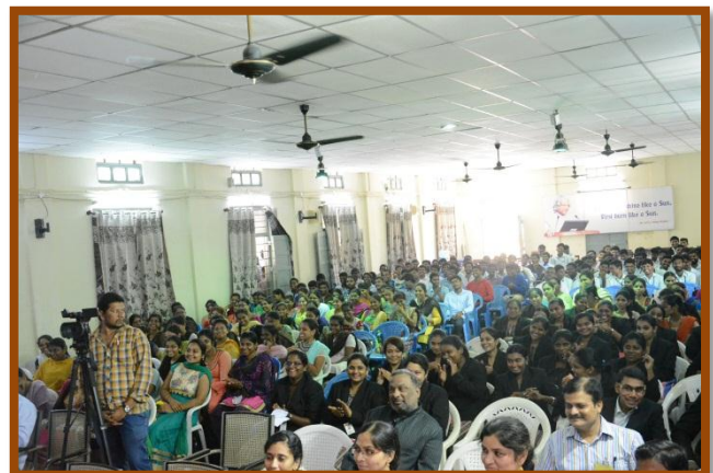
Staff & Participants at the seminar