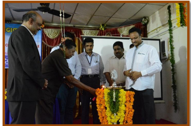
Lightening of lamp