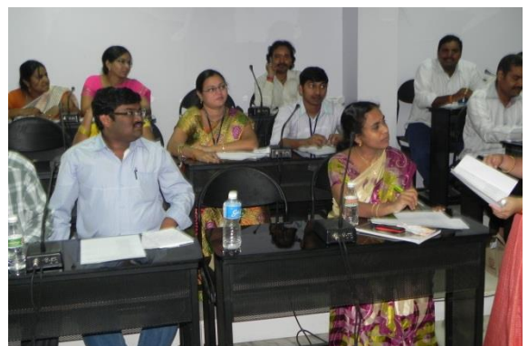
Staff noting down the important points