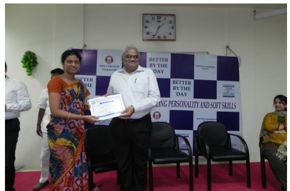
Certificates distribution to the staff