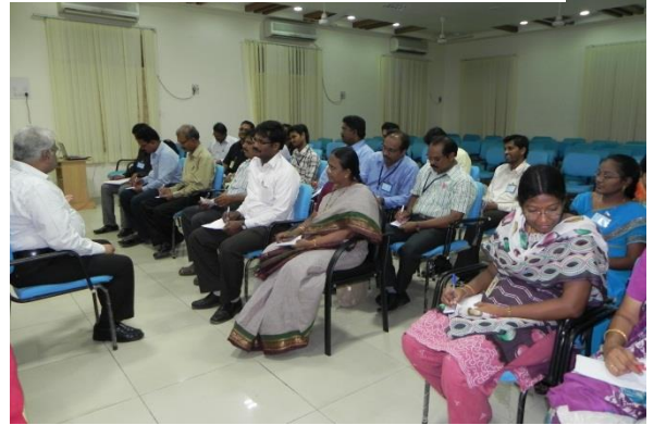
Staff serious participation in the program