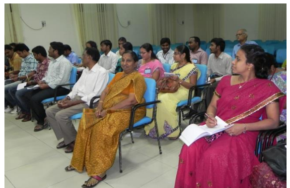
Staff in the program