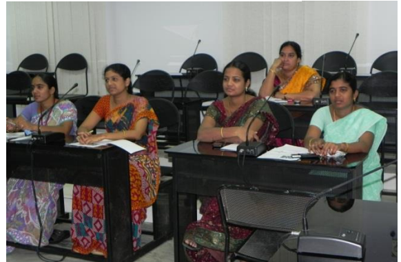
Staff serious participation in the program