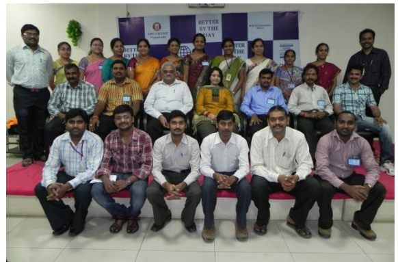
Staff with resource persons