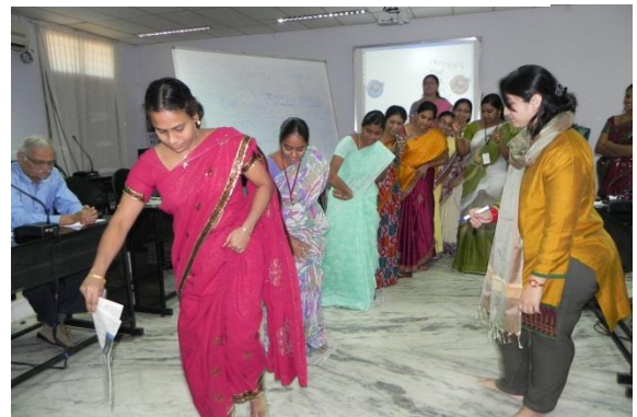
Staff engaged in a game