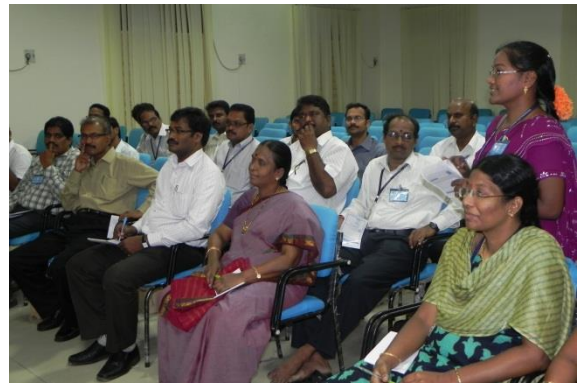
Interaction with staff