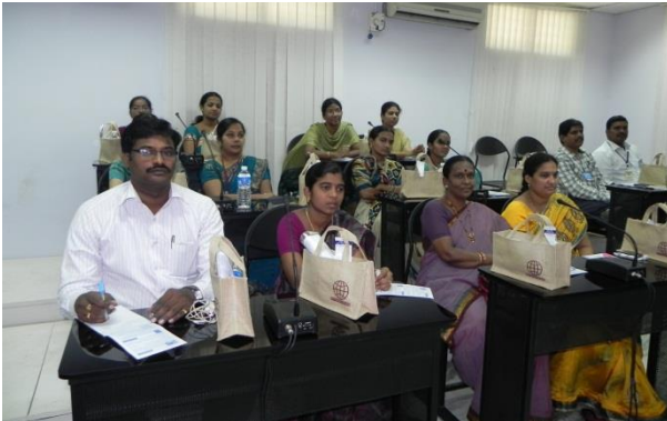
The spell bound faculty members who participated in the innovative staff orientation workshop