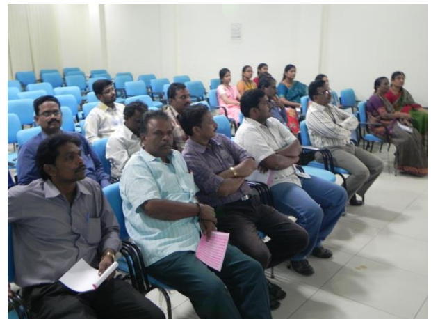
Participants at the faculty development program