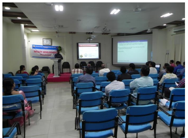
Participants at the faculty development program