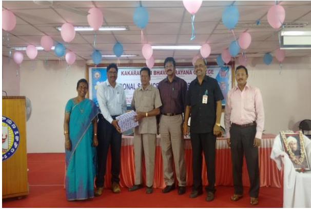
Presentation of Memento to the Chief Guest