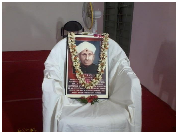
Sir. C V Ramanujam Nobel Prize winner in Physics