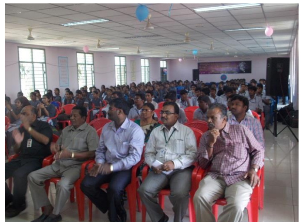
Staff & Students at the National Science Day Celebrations