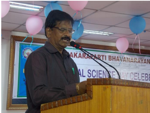
Presidential Address by Principal