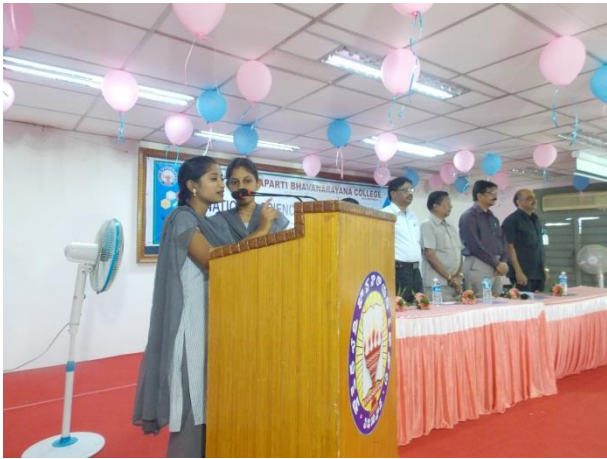
Prayer by Students