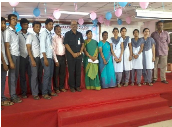
Prize Winners of National Science Day