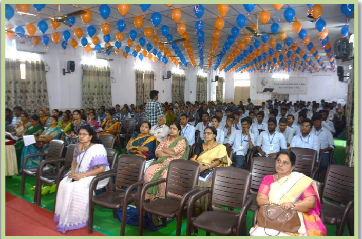
Participants at the Programme