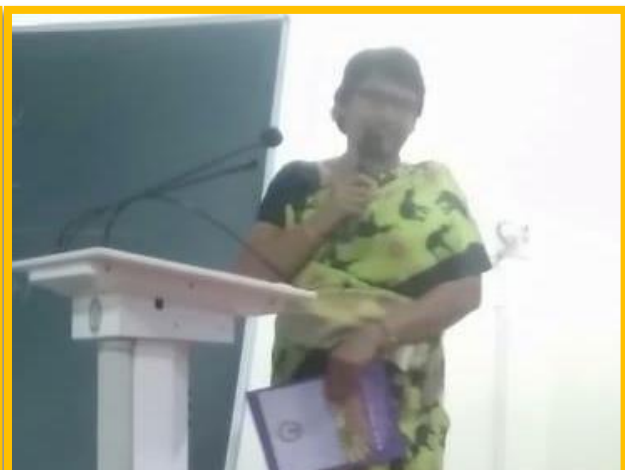
Feedback from Participants